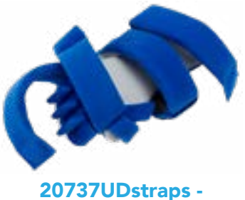
Ulnar Drift Straps