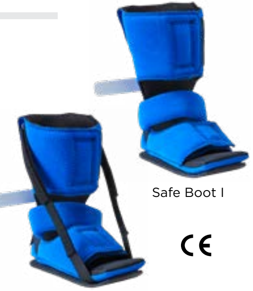
Safe Boot II

* Available in sizes from S to XL, or Universal style for one size fits most adults.