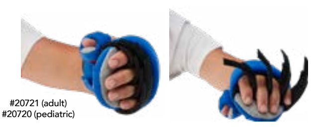
20737UD -Ulnar Drift Finger Separators