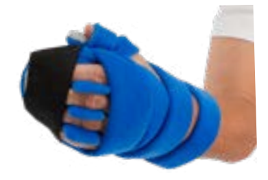
20736D -Dorsal Interphalangeal Flexion Assist