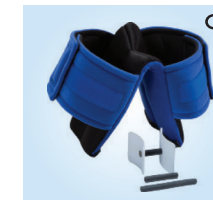
CE RM RestAir Hip Product # 20760air L-Code L1652

Helps to improve and/or restore extension lost range of the knee with effective prolonged low load passive stretch.