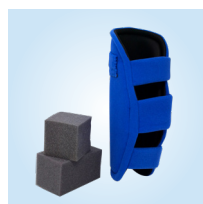
Elbow Separator (Accessory for NeuroFlex® Restorative Elbow) Product # 20724SP

Addresses mild to severe flexion contractures, including those with below elbow amputations (BEA).