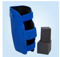
Knee Separator (Accessory to NeuroFlex® Restorative Knee) Product # 20725SP

Addresses mild to severe flexion contractures, including those with below knee amputations (BKA).