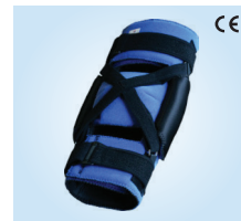
CE RM RestAir Knee Product # 20755air L-Code L1831/L1847

Addresses dystonia, torticollis and wry neck conditions.