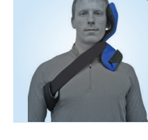
CE NeuroFlex® Restorative Kentucky Kollar Product # 20735 L-Code L0113

Helps to gradually separate the knee joint before transitioning to the NeuroFlex® Restorative Knee.