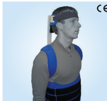
CE NeuroFlex® Restorative Cervical Extension, Forward Product # 20728C L-Code L0999

Helps to immobilize and support the lumbar spine for soft tissue injuries and relief of low back pain. Shown with optional shoulder straps. Available with pendulous abdomen front.