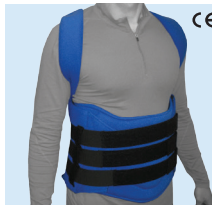
CE NeuroFlex® Restorative Safe Spine Product # 20728 L-Code L0454/L0455

Helps to improve posture including kyphosis, lordosis, scoliosis and other spinal deformities. Padded shoulder straps encourage upright posture.