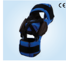
CE NeuroFlex® Restorative Knee Product # 20725 L-Code L1831

Addresses mild to severe flexion contractures, including those with below knee amputations (BKA).