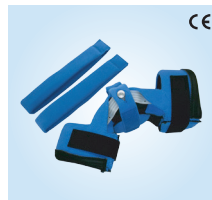
CE NeuroFlex® Restorative Hyperextension Knee Product # 20725H Suggested L-Code L1831

Addresses knee flexion contractures with air technology.