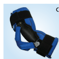
CE RM RestAir Elbow Product # 20724air Suggested L-Code L3760

Helps to gradually separate the elbow joint before transitioning to the NeuroFlex® Restorative Elbow.