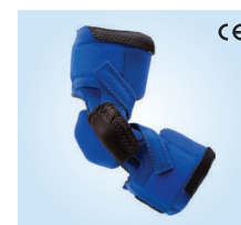
CE Neuroflex® Restorative Elbow Product # 20724 L-Code L3760

Addresses mild to severe flexion contractures, including those with below elbow amputations (BEA).