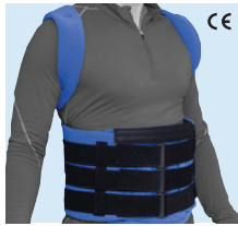
CE RM VertebrEase TLSO Product # 20730 L-Code L0456/L0457

Helps to improve posture including kyphosis, lordosis, scoliosis and other spinal deformities. Padded shoulder straps encourage upright posture.