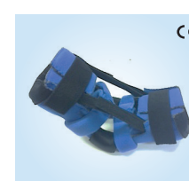
CE NeuroFlex® Restorative Hyper-Extension Elbow Product # 20724H L-Code L3760

Addresses elbow flexion contractures with air technology.