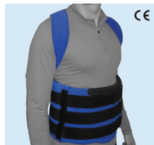
CE RM VertebrEase LSO Product # 20729 L-Code L0631/L0648

Fits into our TLSO and addresses neck hyper-extension, head leaning.